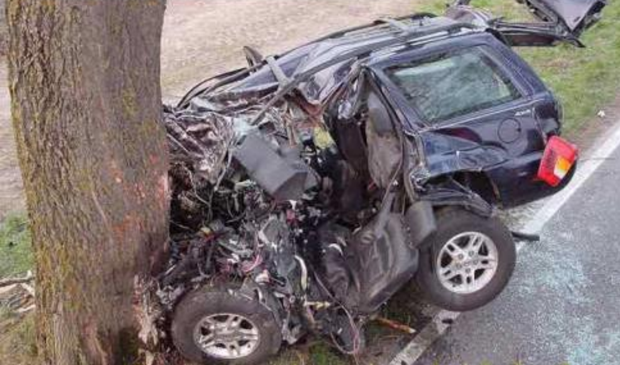
Jeep, Grand Cherokee